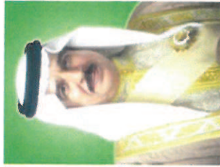
His Majesty King Hamad bin Isa Al Khalifa King of Bahrain