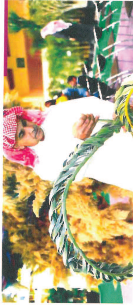
Exhibit in the Garden Show of the Year!

The Bahrain International Garden Show will showcase the opportunities available for investing in Agriculture and recommendations for a variety of projects across the agricultural value chain.