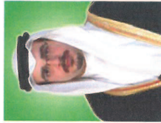
His Royal Highness Prince Salman bin Hamad Al Khalifa Crown Prince & Deputy Supreme Commander