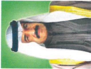
His Royal Highness Prince Khalifa bin Salman Al Khalifa Prime Minister